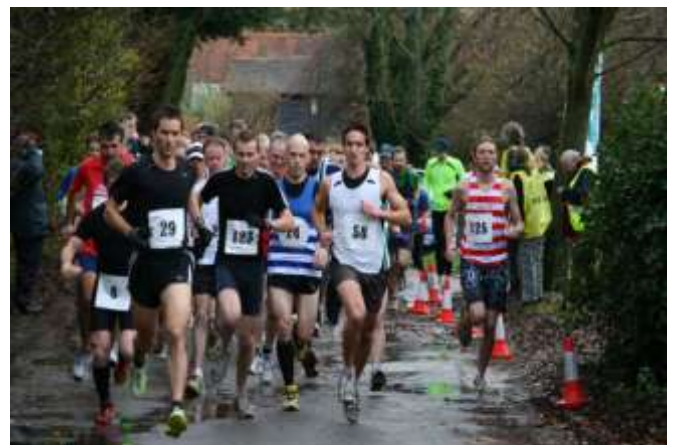
Photo of the start of the 1 st Pednor 10

Please visit www.chiltern-harriers.org.uk .